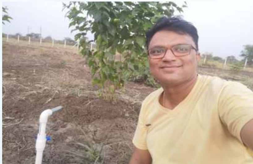
Flash back pic